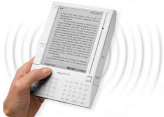
Kindle, the Amazon approach