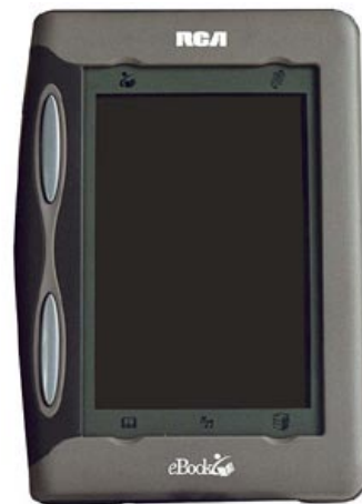
RCA eBook reader

We can start right now to foresee relations with the editorial industry, new business models, new features, applications, etc. I immediately start to set up the planning to address this challenge.